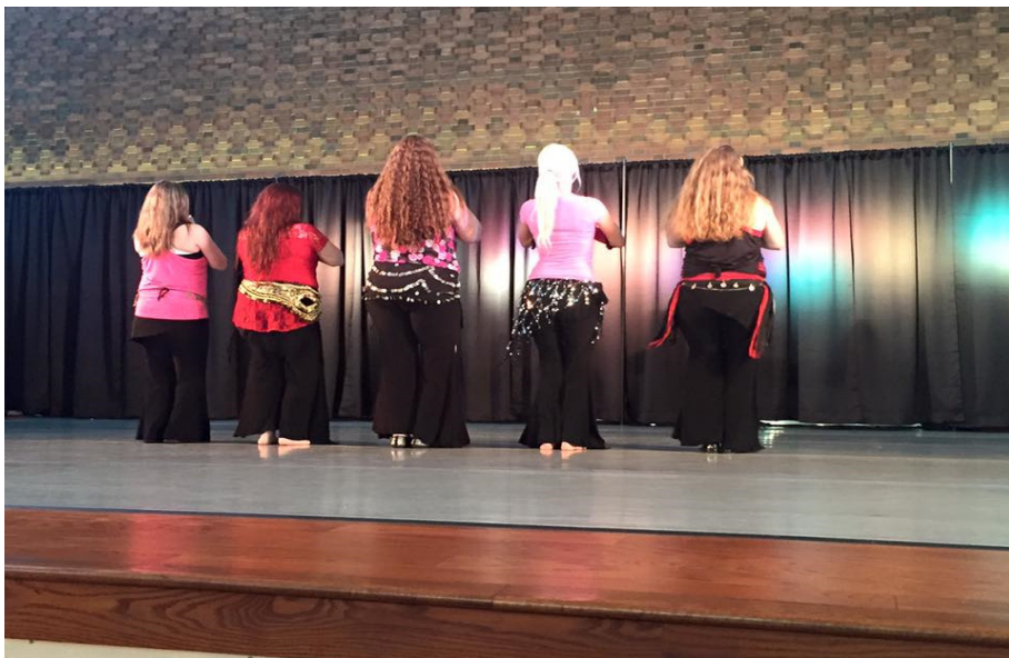
Rebellyon performing at the "Love is a Dream/Love is a Nightmare" hafla

We have four teams in Indiana this year: Fort Wayne, Muncie, Evansville, and Vincennes. The Muncie event will have a hafla and fundraiser from 5-8pm on May 14, with more info here: https://www.facebook.com/events/438742336336753/